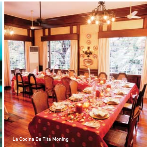
La Cocina De Tita Moning

La Cocina De Tita Moning If you are nostalgic for a taste of Old Manila, dine at the Legarda mansion, a stone's throw away from the Malacanang Palace. The experience of dinner in this 1930s house, one of the first Art Deco homes