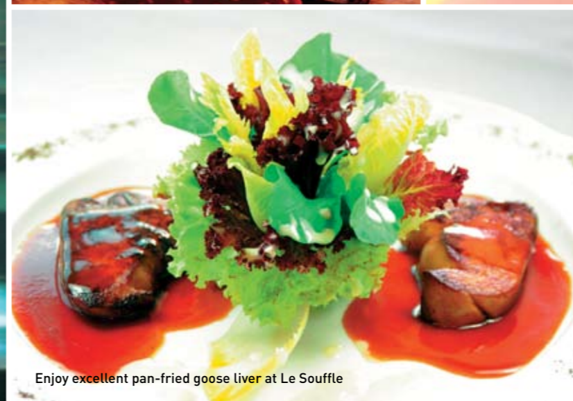
Enjoy excellent pan-fried goose liver at Le Souffle