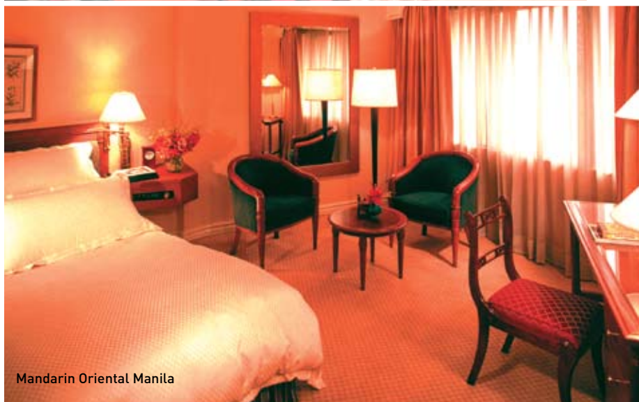
Mandarin Oriental Manila

In addition, the dining experience gets reinvented practically every month, with visiting chefs to satiate your cravings. Prices start from P980. Makati Shangri-La, Ayala Avenue corner Makati Avenue, Makati. Tel: +(632) 813-8888