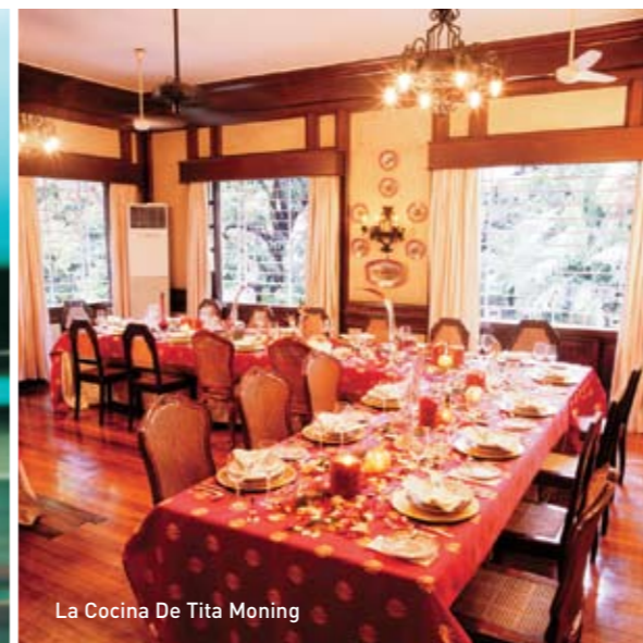
La Cocina De Tita Moning

La Cocina De Tita Moning If you are nostalgic for a taste of Old Manila, dine at the Legarda mansion, a stone's throw away from the Malacanang Palace. The experience of dinner in this 1930s house, one of the first Art Deco homes